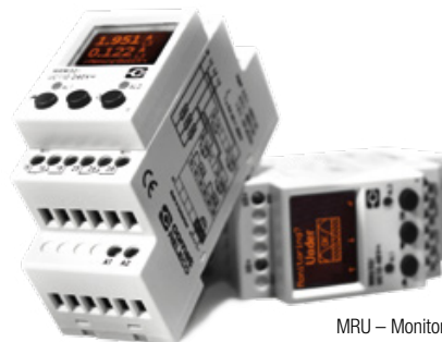
MRU – Monitoring for the SMARTcharge system

The high-quality monitoring devices from ComatReleco come from the MR series and have been developed for monitoring of 1- and 3-phase systems. The devices are suited for monitoring of all electrical variables, such as voltage, current, performance (AC/DC), frequency, phase sequence or power factor \cos\varphi and generating an alarm in the case of disturbances or faults. Servicing them is user-friendly. At the push of a button, the devices show measured values, user parameters and operating status. For the output there are two change-over contacts for 6 A, 250 V. Both contacts can be configured independent of one another. The devices correspond to the DIN 43880 standard, with a mounting dimension of 35 mm.