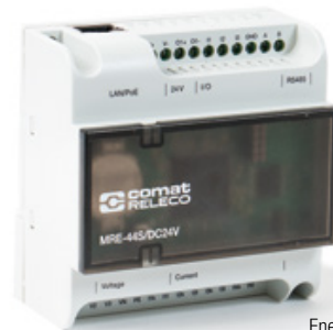
Energy-measuring device MRE-44S/DC24V